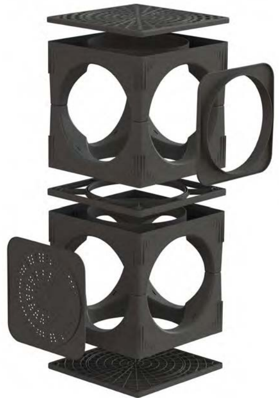
CUDO components snap together, forming a single or multiple stack. Assembled stacks are installed to form the desired system size and shape, with a maximum amount of footprint flexibility.