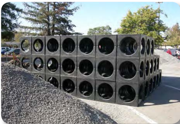
CUDO stacks ready for installation in San Rosa, California